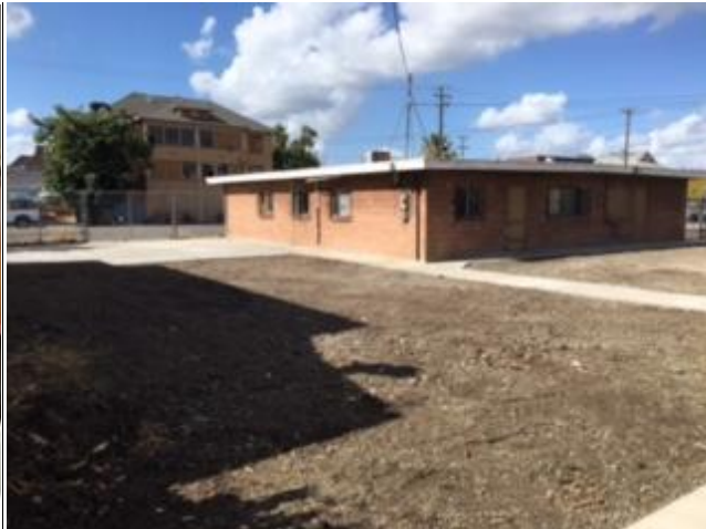
New 14 Bed Facility Under Renovation

ANNUAL OPERATING COST: $400,000/year requirement.