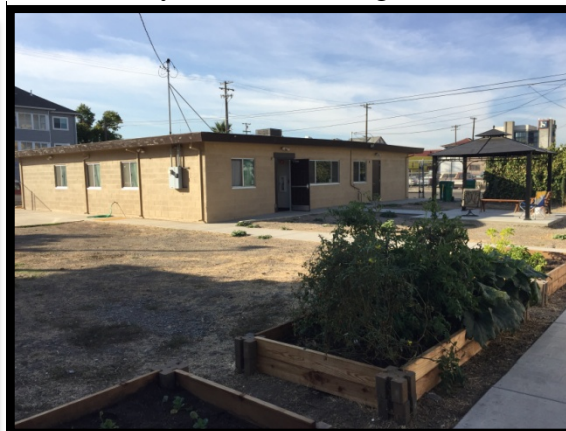
17 Bed Men's Recuperative Care Center

ANNUAL OPERATING COST: $30,000/bed or $750,000 for 25 beds.