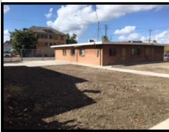
New 14 Bed Facility Under Renovation

ANNUAL OPERATING COST: $650,000 PROPERTY PURCHASE LOAN: $80,000