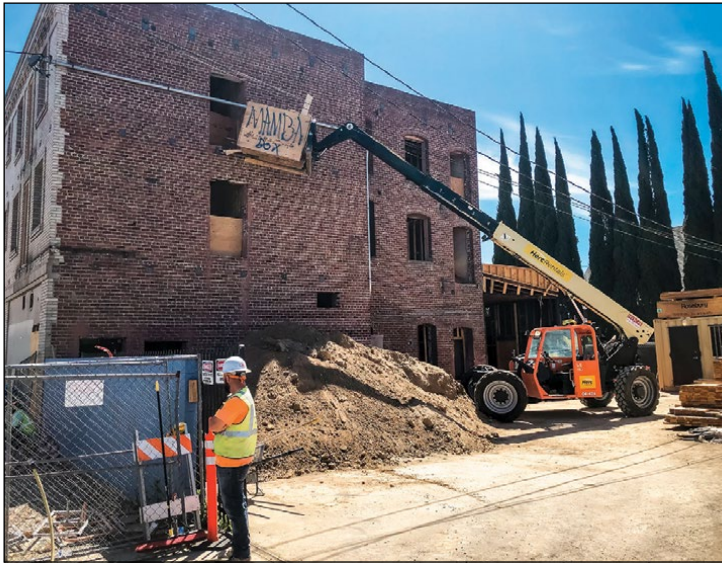
New Life's Women's Home active construction site!