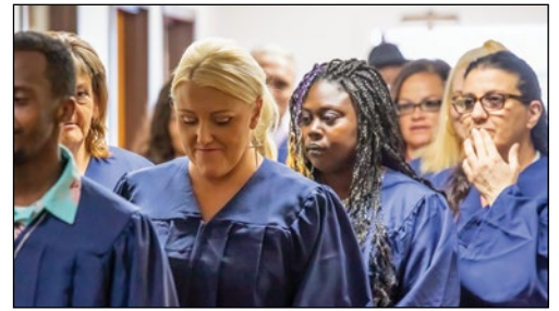
Anticipating their entrance to the ceremony.