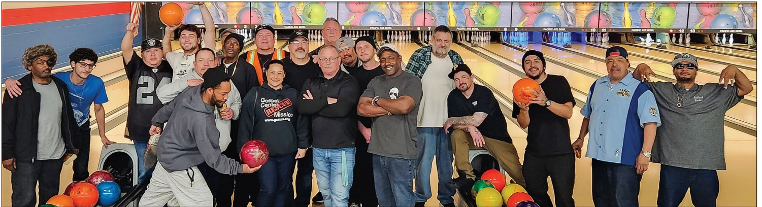
Our Men's New Life Program students and staff had so much fun bowling!