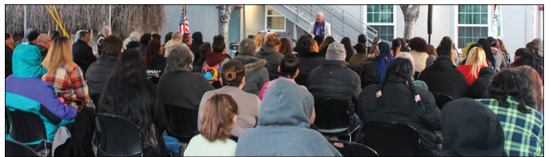
He is Risen! He is Risen Indeed! Sunrise Service at The Mission.