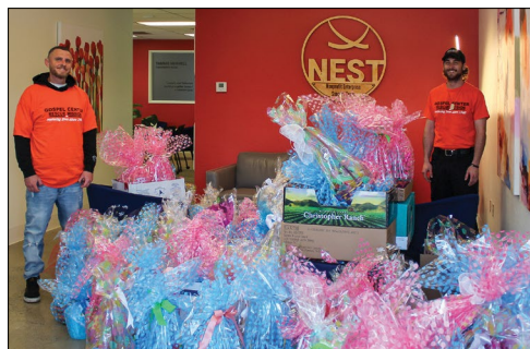
Two New Life Program (NLP) students and staff delivered Easter baskets from the United Way to children living in Sierra Vista. The NLP students stayed and helped set out children's books to be given away and also helped hide Easter eggs for the neighborhood Easter Egg Hunt!