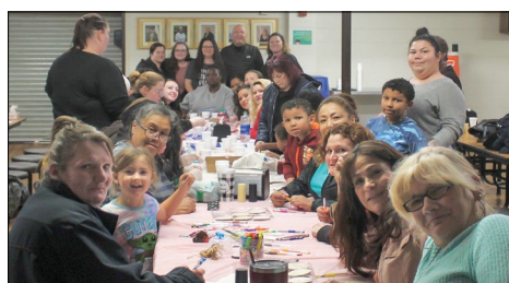
New Life Program Ladies and our Mission Kids Decorating Easter Cookies.