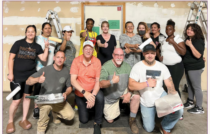
Clean Slate Paint crew in training

Our second venture is Church Street Coffee . Our NLP students will be roasting, bagging, and selling the coffee beans, while learning valuable business skills. Some of our students have already started this process! We are currently working on our website where you can buy our coffee online, for your home, office, or church! Each purchase of Church Street Coffee will help further the GCRM Mission of helping renew lives of the homeless and addicted through Jesus Christ. In the future we plan to have our own roastery and coffee shop right here on The Mission campus. Spread the word to your church, friends, and workplace – Buy Church Street Coffee !