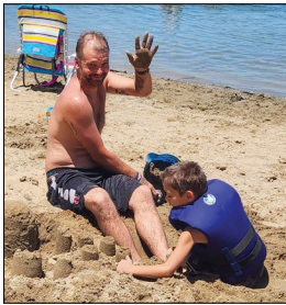
Lodi Lake Day Trip