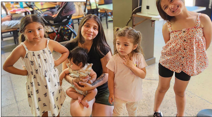
Fun Times at the Sacramento Zoo

Sponsor A CHILD'S SUMMER $500 will sponsor one child and mom