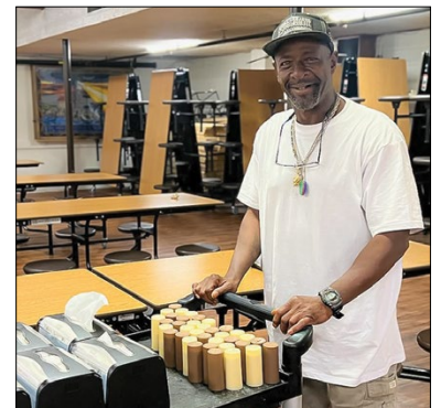
In our New Life Program, students are taught vital life skills such as teamwork and work ethic. The photo shows one of our students completing ministry assignments in the kitchen. They help with preparing and organizing the salad bar, tidying up after lunch, and learning how to properly label and store food. We thank them for all their hard work!