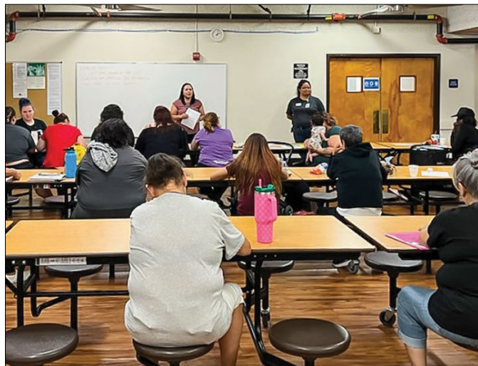
Parents by Choice, from the Child Abuse Prevention Council, is hosting a weekly class for parents enrolled in the NLP. They will receive a certificate upon completing a course on parenting techniques and developing the necessary skills to support their children as they grow into young adults.