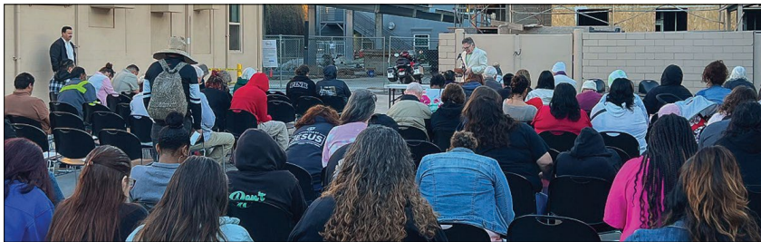
With the New Life Program Center as a backdrop, staff, students and friends of The Mission gathered to celebrate the resurrection of Jesus Christ on Easter Morning.